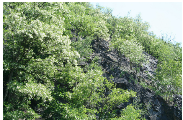
Fig. 3. Robinia tolerates extremely dry sites, and is able to grow even on rocky outcrops. In such habitats it threatens endangered heliophilous plants and invertebrates and poses stability problems.

Over short distances, except in shady, wet or continuously disturbed sites, Robinia is reported to spread locally up to 1 m per year (Kowarik, 1996) by horizontal root elongation and ramets forming a connected root system (Cierjacks et al., 2013). Compared to other species of trees, Robinia is extremely resistant to disturbance. Under unfavourable light conditions, it creates a persistent bud bank including buds on roots, stems and branches, allowing rapid reaction to canopy opening following disturbance (Kowarik, 1996). The tree produces numerous root suckers, even trees over 70 years old. Compared to the seedlings of other species of the same age, they are taller, grow faster (annually up to 4 m) and reach reproductive maturity earlier (e.g. Kowarik, 1996; Vítková and Kolbek, 2010). Mechanical damage of roots or trunks used as a regeneration method in forestry (coppicing, i.e. short rotation management;