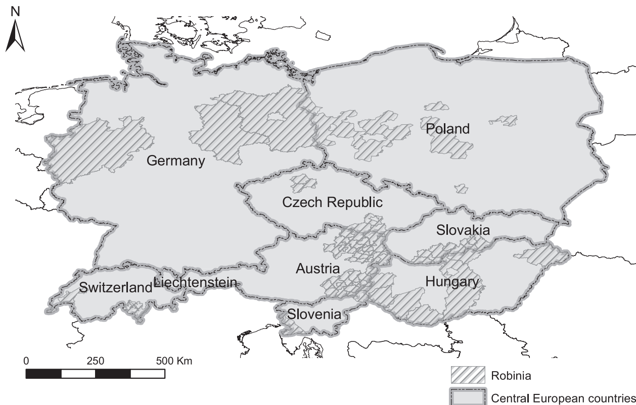
Fig. 1. Areas with the highest occurrence of Robinia pseudoacacia in Central European countries. Definition of Central Europe follows the common concept (e.g. Encyclopædia Britannica) and includes Austria, Czech Republic, Germany, Hungary, Lichtenstein, Poland, Slovakia, Slovenia and Switzerland. References: Austria – Walter et al. (2005), Czech Republic – Forest Management Institute (2014), Germany – Bundesamt für Naturschutz (2013), Hungary – State Forest Service Mapping Department (2006), Poland – Wojda et al. (2015), Slovakia – Slovakian Forest Portal (unpublished data), Slovenia – Slovenian Forest Service (unpublished data), Switzerland – National Forest Inventory (1983–1985).